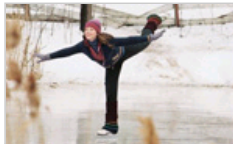
Why Figure-Skating Movies Are So Awful