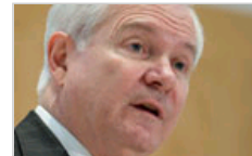
Secretary Gates Gets Testy With NATO. Has the Alliance Outlived Its Use?