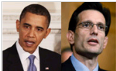
Dickerson: Who Are the Bigger Hypocrites, Democrats or Republicans?