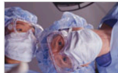
Having Gastric Bypass Surgery Reversed Is a Very Bad Idea