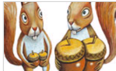
Danish Men Have Smaller Testicles Than Finnish Men. Why?