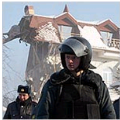
Russians Rally Around a Falling Enclave