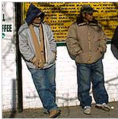
Guatemalans in Brooklyn Keep Bonds of Home