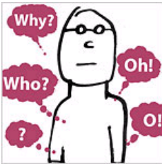
The Body Takes Abstract Thoughts Literally