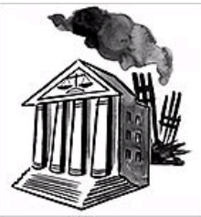
Letters: Moving the 9/11 Trial Out of New York