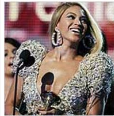
Beyoncé Is a Dynamo but Never a Diva

Steven Strogatz's debut column on math features an introduction to numbers, from upsides (they're efficient) to down (they're ethereal).